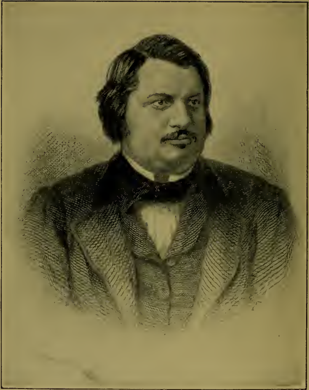
Honoré de Balzac